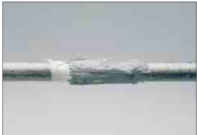
Picture 4 Emergency repair of pipes

putty - steel-filled - super-fast curing - temperature resistant from -35°C up to +90°C