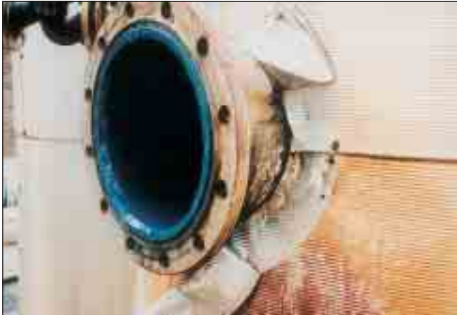
Picture 1 Entrance of CO 2 installation