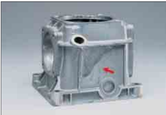
Picture 2 Reconditioning of aluminium housing

putty - aluminium-filled - temperature resistant from -35°C up to +120°C