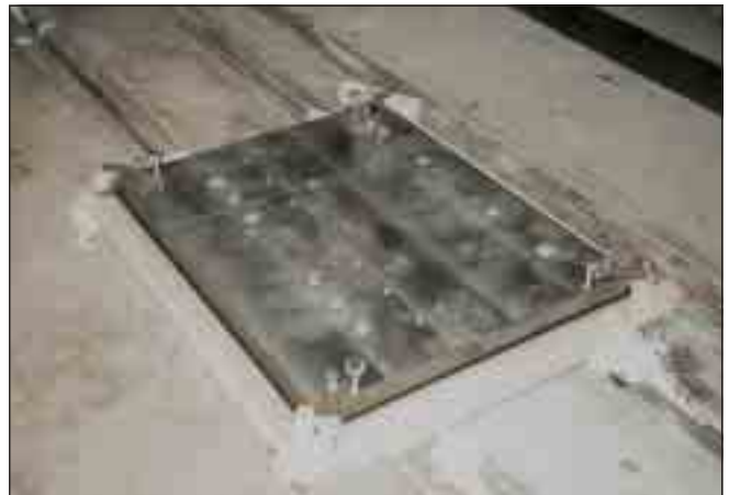
Picture 3 Underfilling of a steel plate

The specifications and recommendations given in this brochure must not be seen as guaranteed product characteristics. They are based on our laboratory tests and on practical experience. Since individual application conditions are beyond our knowledge, control and responsibility, this information is provided without any obligation. We do guarantee the continuously high quality of our products. However, own adequate laboratory and practical tests to find out if the product in question meets the requested properties are recommended. A claim cannot be derived from them. The user bears the only responsibility for non-appropriate or other than specified applications.