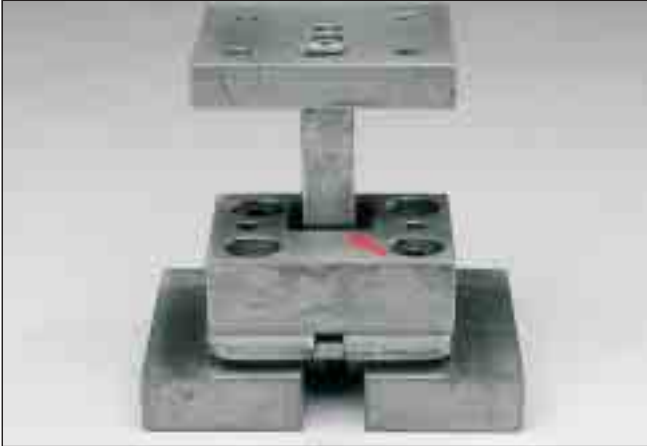
Picture 1 Repair of a guide in blancing press

liquid - steel-filled - wear resistant - temperature resistant from -35°C up to +120°C