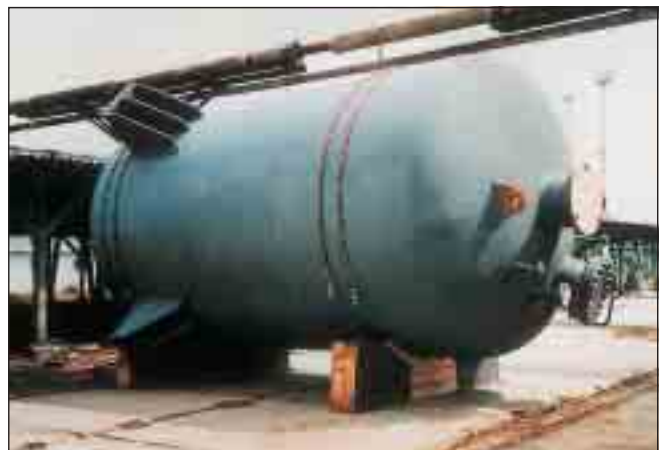
Picture 4 Inner lining of a tank in chemical plant