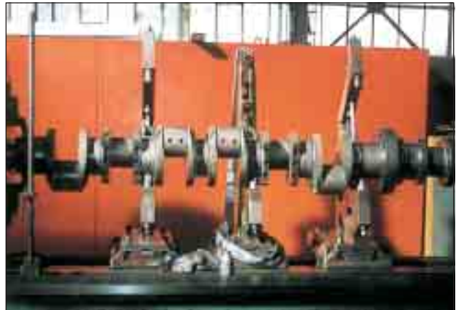
Picture 2 Crank shaft of a Diesel generator

When using WEICON Plastic Metal observe the physical, toxical and ecological data and the safety regulations contained in the relevant EC Safety Data Sheets, which are available upon request.