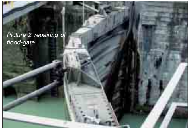
Picture 2 repairing of flood-gate

putty - titanium filled - cures even under water non corrosive - salt water resistant. temperature resistant from -35°C up to +120°C