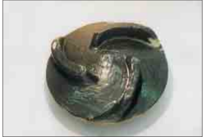
Picture 3 Wheel of a centrifugal pump

putty - mineral-filled - wear resistant - temperature resistant from -35°C up to +120°C