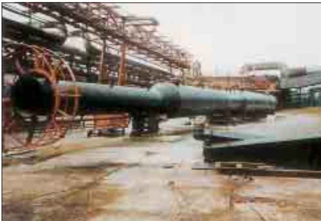
Picture 1 Flare bleeder in a petrochemical factory

WEICON Plastic Metals are two-component epoxy resin systems. All types are supplied in a retail package which contains the resin and hardener components in the correct mixing ratios. Depending on type, the resin component is filled with either steel or aluminium powder or in some cases, a mineral filler (except Casting Resin MS 1000). The different hardeners determine the viscosity and curing behaviour of each product type.