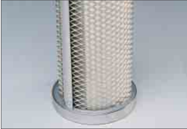
Picture 1 Filter for the food-industry

liquid - aluminium-filled - high-temperature resistant from -35°C up to +220°C