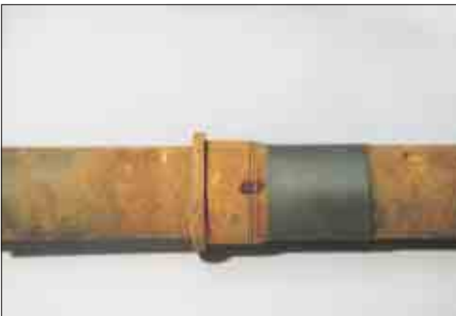
Picture 2 Repair of a primary shaft

putty - steel-filled - high-temperature resistant from -35°C up to +200°C, shortly up to +280°C