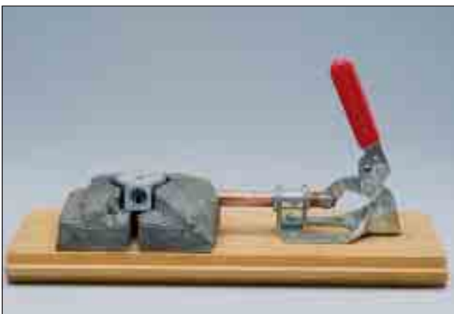
Picture 4 Fixing device

putty - steel-filled - temperature resistant from -35°C up to +120°C