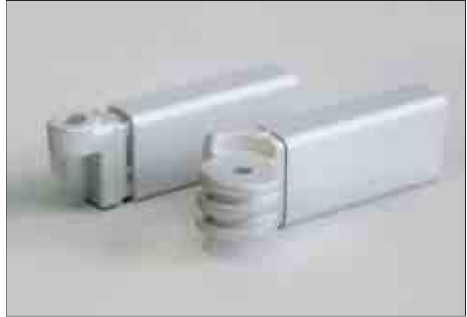
Picture 3 Articulated arms of awnings

liquid - aluminium-filled - temperature resistant from -35°C up to +120°C