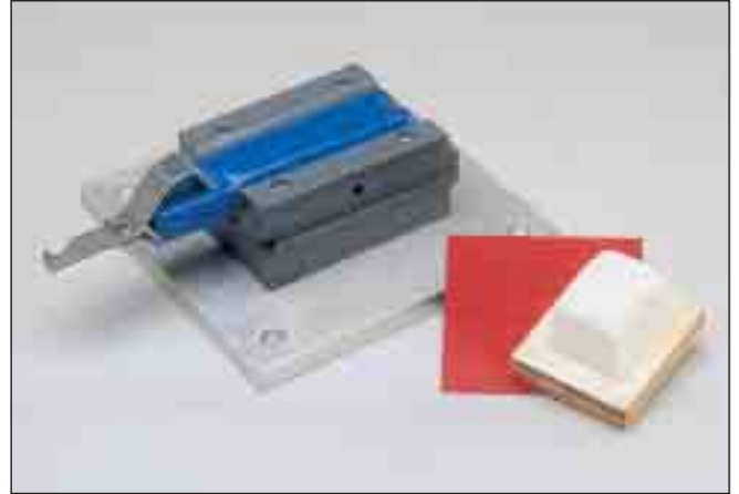
Picture 5 Holding device

liquid - steel-filled - temperature resistant from -35°C up to +120°C