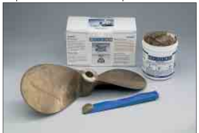
Picture 6 Repair of a ship's propeller

putty - bronze-filled - temperature resistant from -35°C up to +120°C