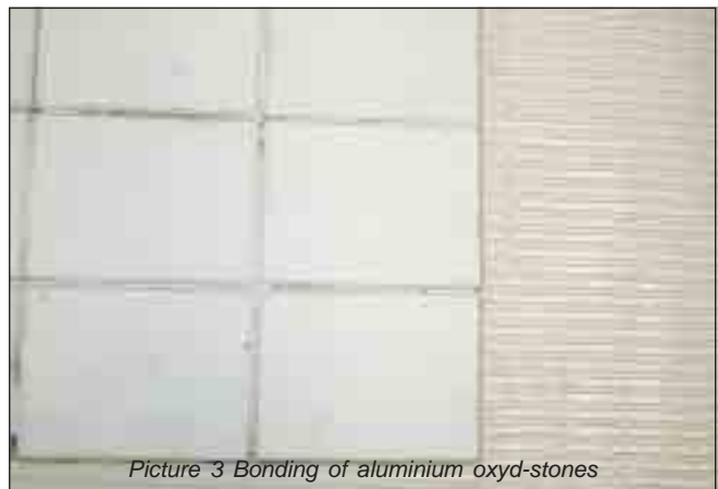
Picture 3 Bonding of aluminium oxyd-stones

putty - mineral-filled - extremely wear resistant - high temperature resistant from -35°C up to +150°C, briefly up to +260°C